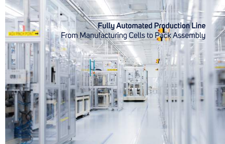
Fully Automated Production Line From Manufacturing Cells to Pack Assembly