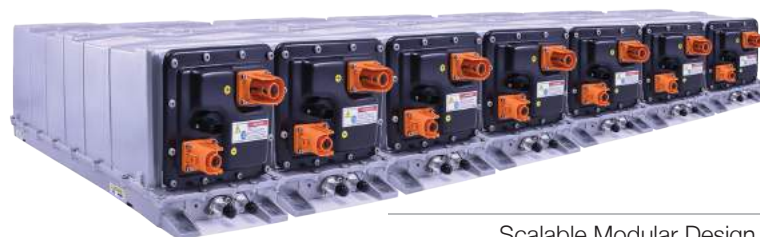
Scalable Modular Design