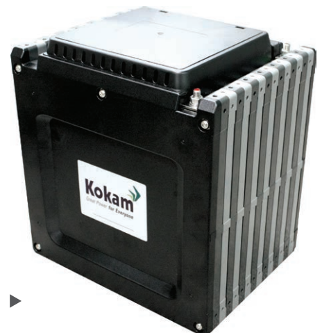
KBM 255 14S - 3.8kWh ▶

Cells within the modules are maintained at optimal temperatures to enable a longer life cycle. Optional heat sink plate can be provided to cool electronic components and increase thermal capability.