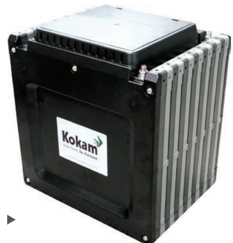
KBM 255 14S - 3.8kWh ▶

Cells within the modules are maintained at optimal temperatures to enable a longer life cycle. Optional heat sink plate can be provided to cool electronic components and increase thermal capability.