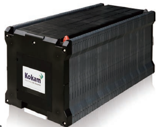
KBM 255 2P 20S - 11.1kWh ▶

Cells within the modules are maintained at optimal temperatures to enable a longer life cycle. Optional heat sink plate can be provided to cool electronic components and increase thermal capability.